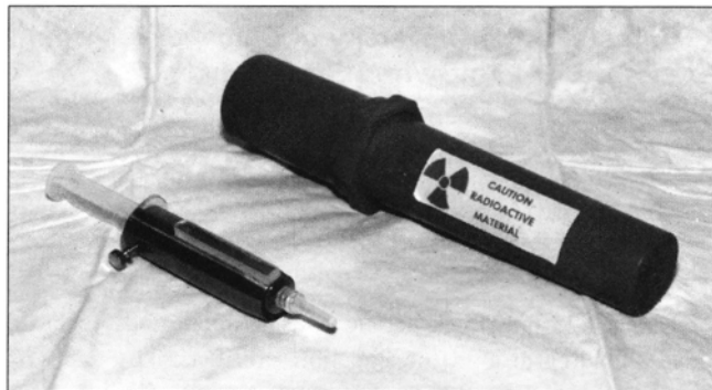
FIGURE 4. A tungsten syringe shield (left) and a standard lead pig (right).

tungsten is more expensive than lead, a tungsten shield will be significantly smaller, weigh slightly less and be more durable than a lead shield. In addition, a tungsten shield will avoid potential concerns related to lead toxicity.