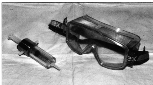
FIGURE 3. The University of Chicago positron shield (left) and a pair of industrial safety goggles (right).

We are presently constructing a system with an integrated dose calibrator using 20–25-mm-thick tungsten. This amount of tungsten should absorb 98% of the gamma photons. While